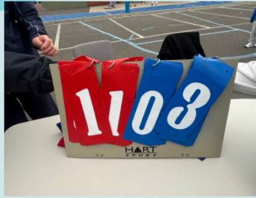
The Final Score