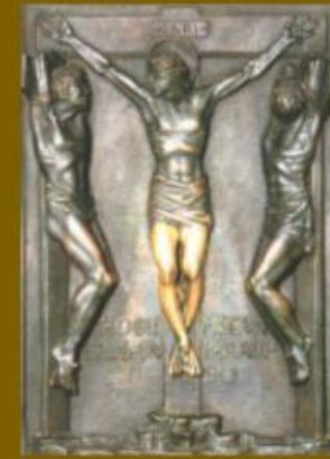
In Front of the Crucifix The Good Thief