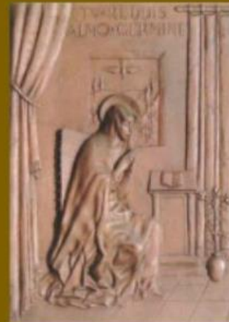
Mary The Annunciation