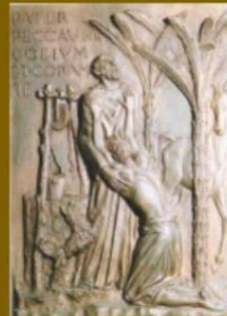
The Merciful Father

Father I have sinned against heaven and also you