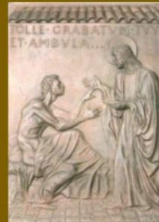
The Cure of a Paralytic

Father I have sinned against heaven and also you