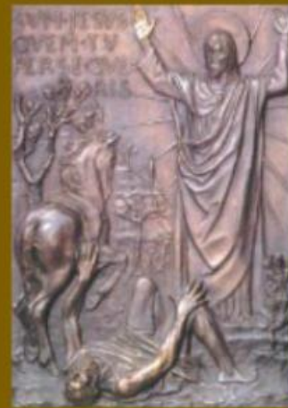
The Conversion of Saul