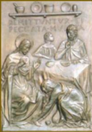
The Woman who was a Sinner