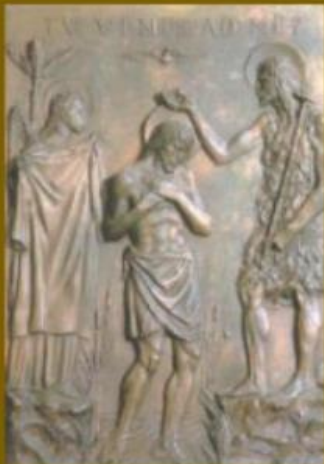
Christ's Baptism in the Jordan