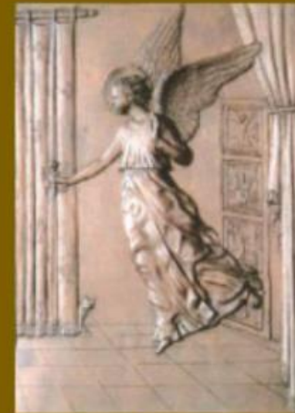
The Angel of The Annunciation