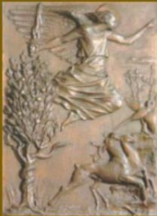
The Angel at the Gates of Paradise