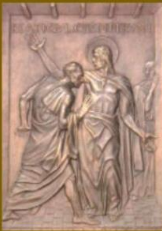
The Appearance to Thomas