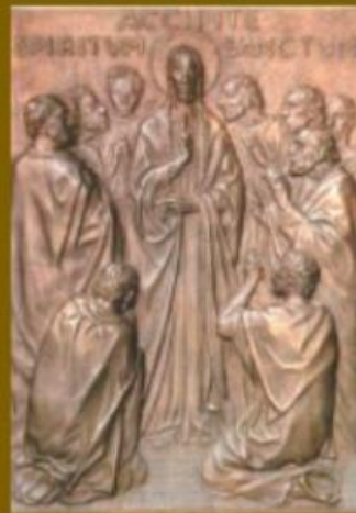
Christ's Appearance to The Disciples