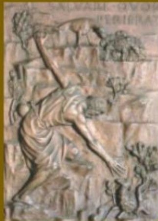
The Lost Sheep